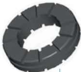
MELDIN 1380 BEARING

This bearing is molded directly onto the stainless steel chopper screen. The ability of SGPPPL to do this eliminates an assembly operation for the appliance manufacturer, thereby reducing their costs.